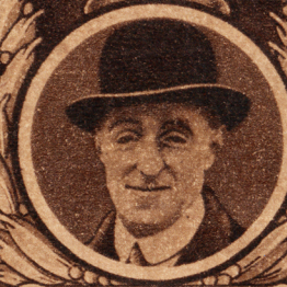
Pte. L. KEYSOR, V.C. (AUSTRALIA).