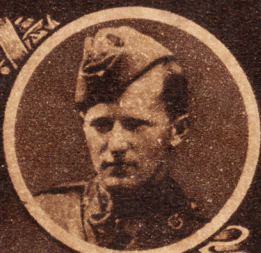
Cpt. W. A. BISHOP, V.C. D.S.O. M.C. (CANADA).